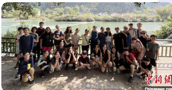
American students by the Li River

On March 26, a delegation of 36 faculty and students from the Chinese American International School (CAIS) in San Francisco arrived in Guilin, embarking on an 11-day study tour.