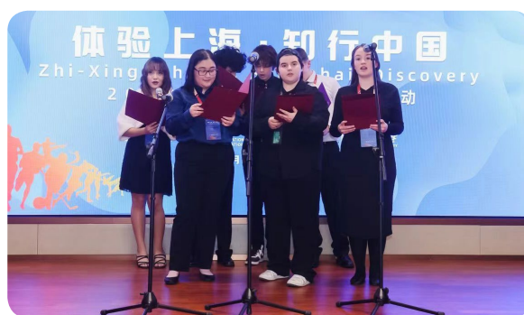
Poems recitation by the students from Muscatine

countries took the stage to share their experiences and present a gala performance. With a gentle breeze outside and warmth inside the cabin, they bid reluctant farewells amid laughter and joy. This event has planted the seeds of friendship, promising a lasting bond for the future.