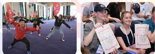
American students savored traditional Chinese culture and cuisine