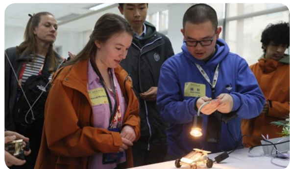
Students from Muscatine High School in the United States share what they have seen and heard with students from High School Affiliated to Fudan University

At the Second School Affiliated to Fudan University, the school's Chinese orchestra performed classic pieces such as Bu Bu Gao for their friends from America. Students from both countries were divided into four groups, sitting in circles on the ground to play games. Guided by prompts on their cards, they shared their interests and hobbies. Through these lively conversations, the students enhanced their friendships. After the games, they also participated in traditional activities such as paper cutting, Chinese knotting, and making spring rolls.