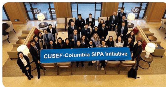
The student delegation visited Peking University and Tsinghua University