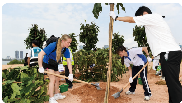
45 "Trees of Friendship" in the Sino-US Youth Friendship Forest area planted to commemorate the 45th anniversary of China-US diplomatic relations

At the concluding ceremony on March 26th, the American teachers and students shared their discoveries and experiences from this visit. The American students used slides and other methods to show Chinese cities, campuses, and social life from their perspectives. They expressed their admiration for China's societal achievements and offered their recommendations for enhancing cooperation between China and America in environmental