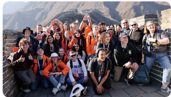
American students toured the Forbidden City and climbed the Great Wall