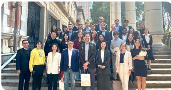
JHU student at Yunnan University