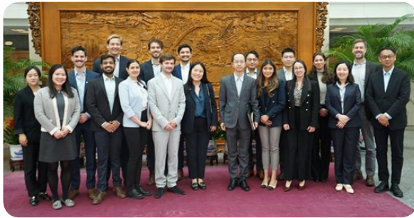
JHU students at the Ministry of Foreign Affairs of China