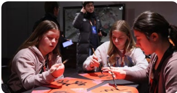
Muscatine students in Yu Garden to experience traditional Chinese culture

They also visited Fudan University, where they watched a photo exhibition at the Center for American Studies (CAS) of Fudan University to learn about the university's exchanges with the United States. They also learned about the binding and repair techniques for ancient Chinese books, had a hands-on experience of traditional paper-making technique, and visited the historic building Xianghui Hall, which is used to commemorate the university's late presidents. On April 30th, 1984, Ronald Wilson Reagan, then President of the United States, delivered a speech there. The students revisited this historical moment by watching the speech video.