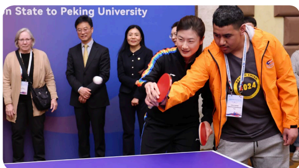
Chinese Olympic champion Ding Ning taught American students to play ping-pong