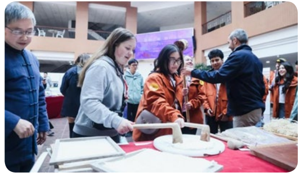
The students from Muscatine High School in the United States experienced the ancient art of paper making

They also visited Fudan University, where they watched a photo exhibition at the Center for American Studies (CAS) of Fudan University to learn about the university's exchanges with the United States. They also learned about the binding and repair techniques for ancient Chinese books, had a hands-on experience of traditional paper-making technique, and visited the historic building Xianghui Hall, which is used to commemorate the university's late presidents. On April 30th, 1984, Ronald Wilson Reagan, then President of the United States, delivered a speech there. The students revisited this historical moment by watching the speech video.