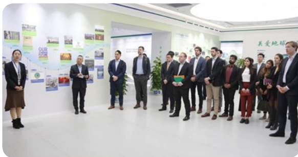
JHU students at China Energy Conservation and Environmental Protection Group