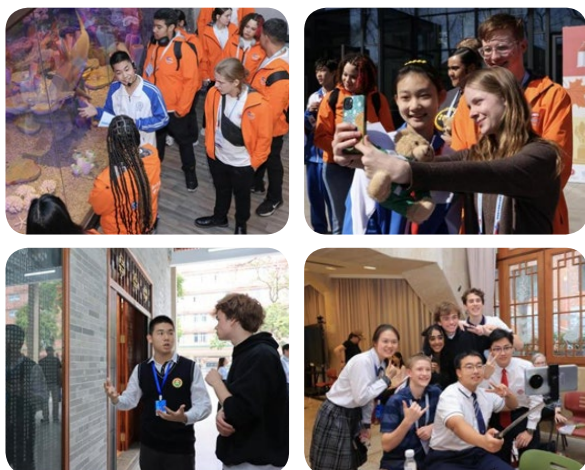
American students had in-depth exchanges with Chinese students