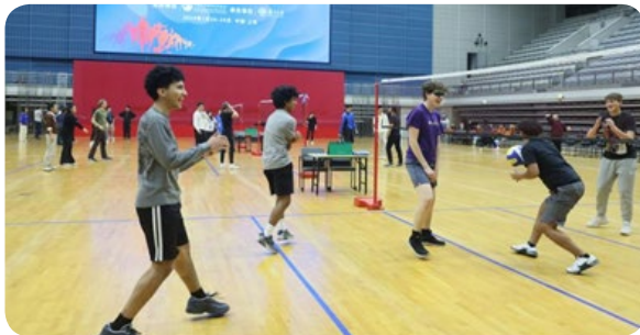
Muscatine students in a light volleyball match

On January 24th, the student delegation from Muscatine High School arrived in Beijing. The students visited the Forbidden City and the Great Wall, and then went to Shijiazhuang Foreign Language School in Hebei Province to interact with the local students. They became "language partners" for each other. After arriving in Shanghai on the 26th, Muscatine students joined the Sino-American Youth Friendship Event.