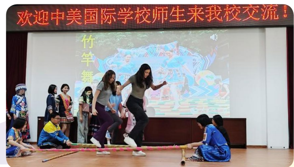
Chinese and American students performed bamboo pole dance together