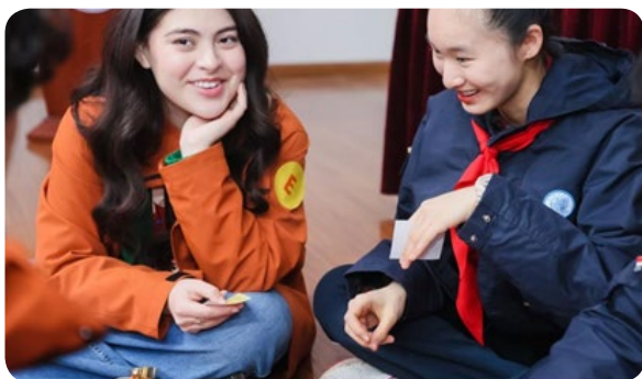
Students from Muscatine High School in the United States participate in a robotics experience event