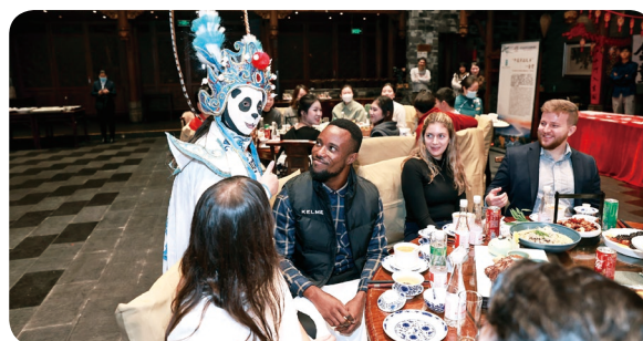
The student delegation participated in the "China-U.S. Youth Gala Dinner"