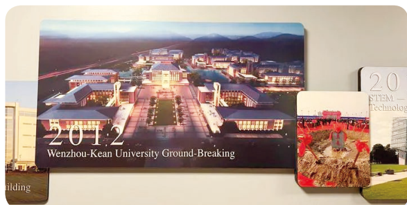
Founding stone laying ceremony photos of Wenzhou-Kean University in the corridor of the Student Center at Kean University's main campus

In the corridor of the Student Center at Kean University in New Jersey, photos of the university's various campuses are displayed. Among them, the photos of the beautiful campus scenery of Wenzhou-Kean University and the founding stone laying ceremony attract the most attention. Everyone interviewed on the campus is familiar with this China-U.S. joint venture university.