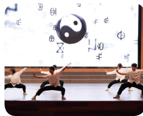
Welcoming songs and dance