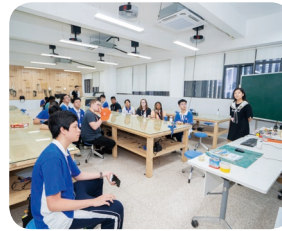
General Technology Class | Laser Manufacturing