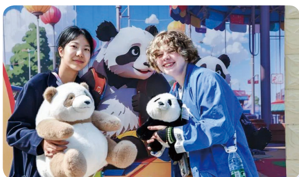
Chinese and American students with a panda toy at the giant panda exhibit in Shijiazhuang Zoo, April 21