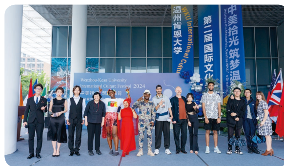
Chinese and American teachers and students in an International Cultural Festival event at Wenzhou-Kean University, on April 26