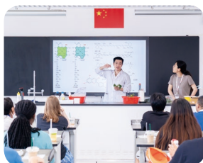
Biology Class | Extraction and Separation of Plant Pigments